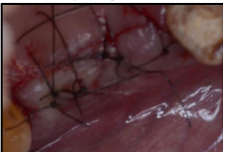
Fig. 4: Sutured with monofilament (5.0)

completely, but as of now a staged procedure where direct sinus lift is done in the first stage and implants are placed in the second seem to be the more predictable way of achieving success.