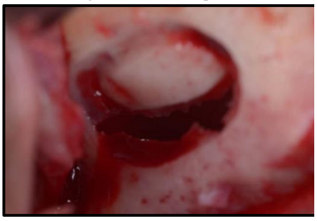
Fig. 6: Intact sinus membrane seen